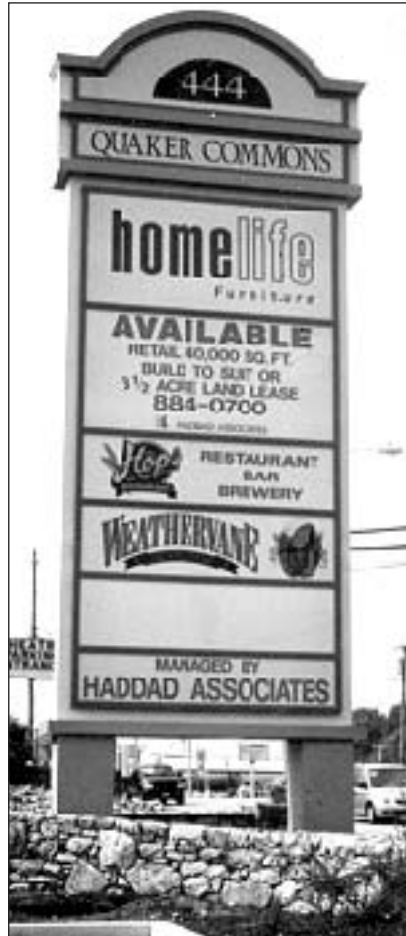
Quaker Commons, Warwick