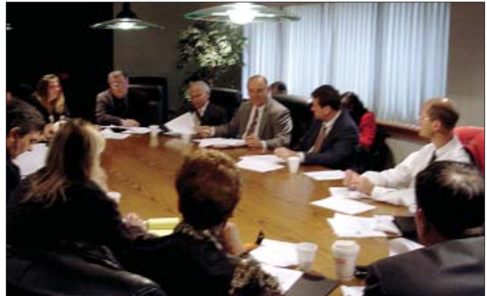
Cranston Chamber of Commerce Board of Directors Meeting