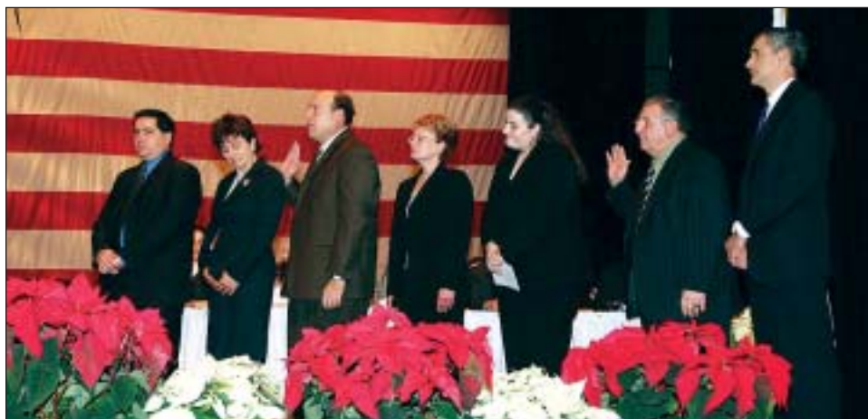
Members of the School Committee are sworn in

Thank you to Al Weems of Al Weems Photography for the inaugural pictures.