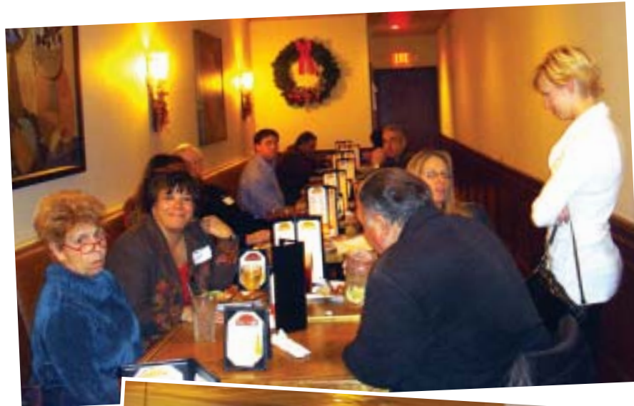
Feast or Famine fills up with festive guests who enjoyed food and beverage throughout the evening