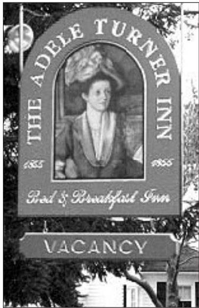
Adele Truner Inn, Newport