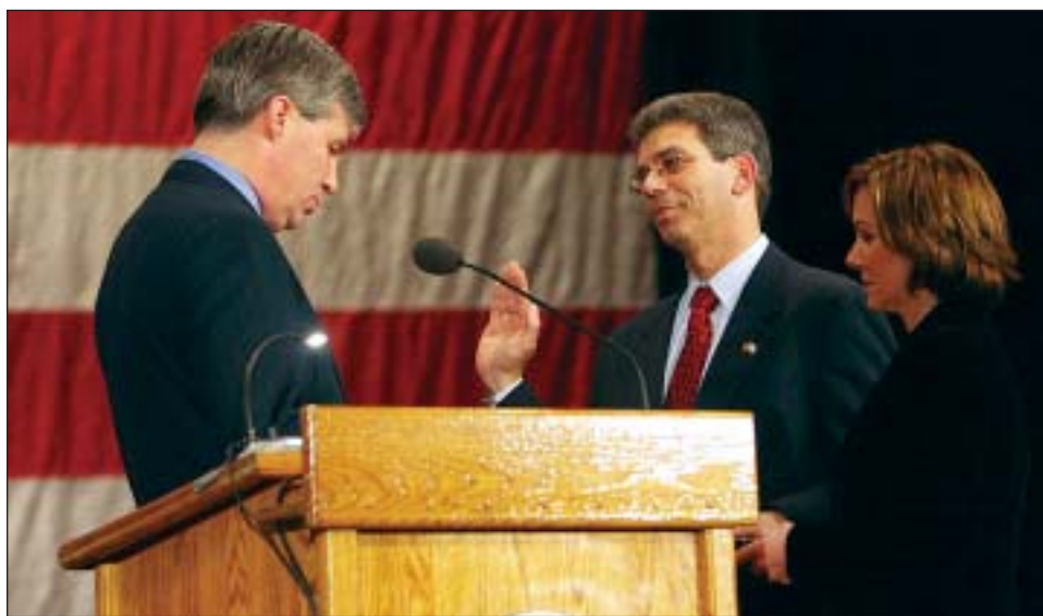
Cranston's new mayor, Michael Napolitano is sworn in by Senator Sheldon Whitehouse.