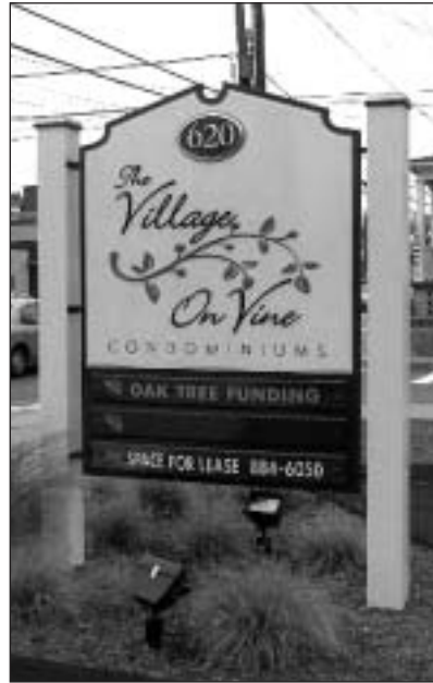
The Village Vine (East Greenwich)

At the Annual Rhode Island Sign Contractors Association Awards held in December, AA Sign & Awning walked away with numerous awards. Entries were judged on the basis of overall appearance, effectiveness, and originality.