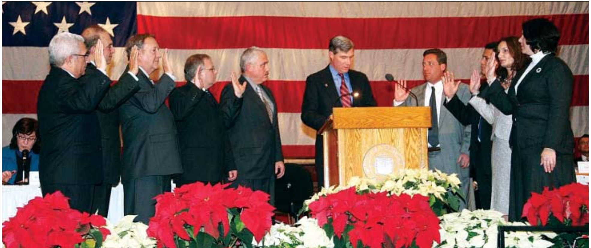
Senator Whitehouse swears in the incoming City Council