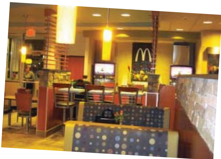
Left: The new interior blends modern style with the tradition of McDonalds we have all known and loved since childhood.