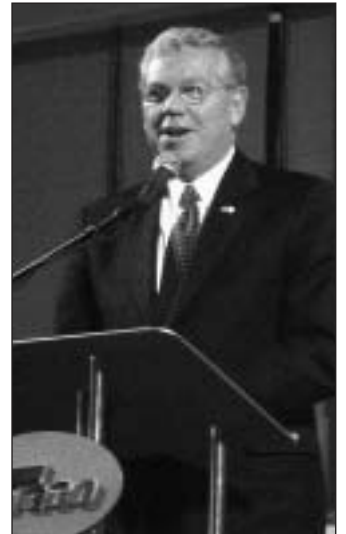
Governor Donald Carceri gives words of welcome to those who came to the building dedication

Do you think you can't afford to have a web-site?