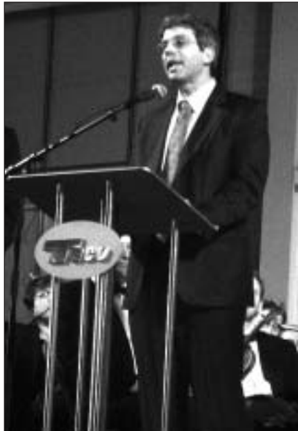
Mayor Napolitano addresses the crowd at the dedication of a new building for one of Cranston's largest and most reputable companies.